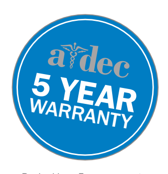
Backed by a 5-year warranty.

Everything about the premium A-dec 500 LED is designed to create optimal working conditions, like continuous light that floods the oral cavity reducing shadows and eye fatigue. A cure safe mode that gives you more time to work with composites. And a complete spectrum of colors that appear precisely as nature intended. Brilliant.