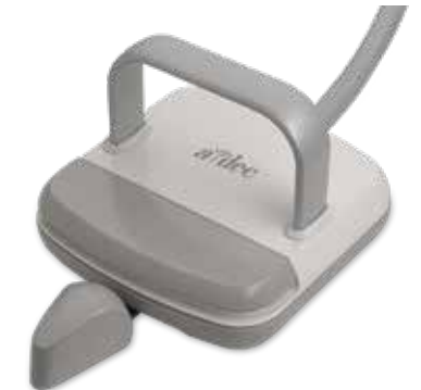
Lever foot control