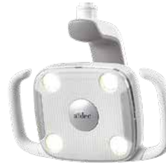
A-dec 300 LED