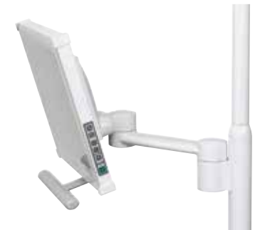
Light post monitor mount with link arm