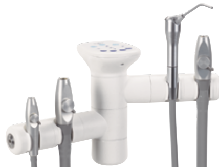
Dual 2-position holder