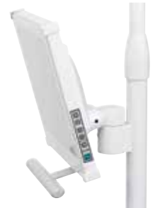
Light post monitor mount