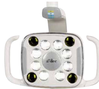
A-dec 500 LED