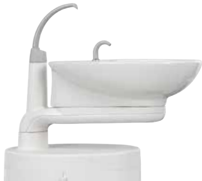
Rotating vitreous china cuspidor