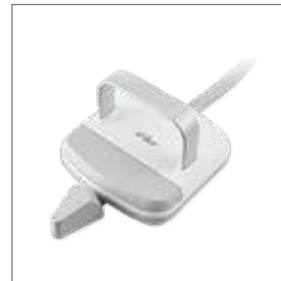
Lever Foot Control