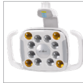
500 LED Light