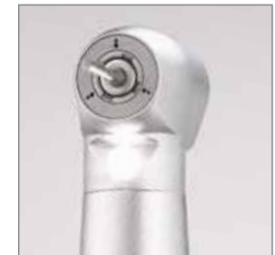
Fiber Optic Light Source