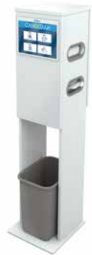
Protect and Sanitize Station without dispenser and refill.