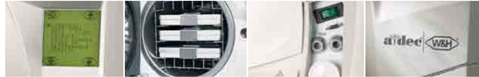
Easy-to-use touch screen and display • Reversible rack holds 5 trays or 3 cassettes • Easy access to service compartment • Standard 1-year/1,000-cycle warranty.

Programmable touch screen provides simple control and displays information about the status of each load.