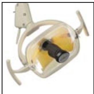
A-dec 571 Dental Light