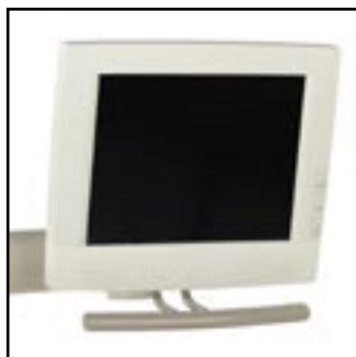
A-dec 561 Side-Support Monitor Mount