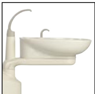
A-dec 561 Cuspidor

When combining the award-winning A-dec 511 chair with Radius delivery, you get an incredibly comfortable chair surrounded by a full range of quality of choices, including two styles of delivery, cuspidor, multiple configurations of assistant's instrumentation, dental light, monitor mounting system, and many more options.