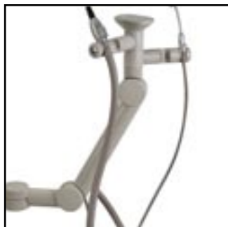
A-dec 551 Short Assistant's Arm