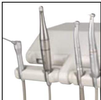
Radius Traditional Delivery