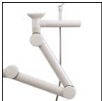
A-dec 551 Long Assistant's Arm

When combining the award-winning A-dec 511 chair with Radius delivery, you get an incredibly comfortable chair surrounded by a full range of quality of choices, including two styles of delivery, cuspidor, multiple configurations of assistant's instrumentation, dental light, monitor mounting system, and many more options.