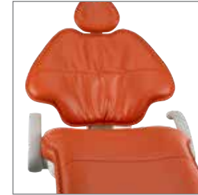
Sewn or formed upholstery