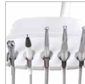
Factory-integrated clinical devices, including electric motors and scalers