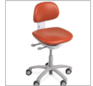
400 or 500 level stools