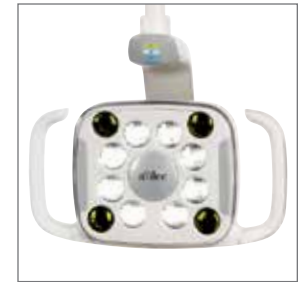
372L or 572L dental light