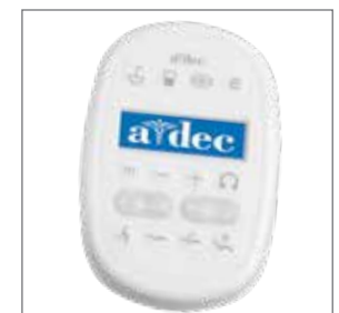
Standard or Deluxe touchpad